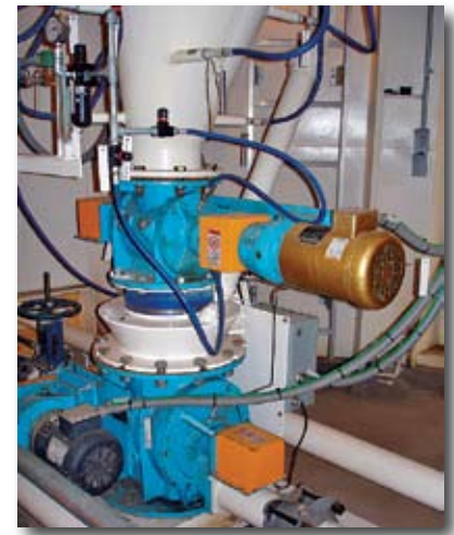
Continuous Loss-in-Weight Feeder